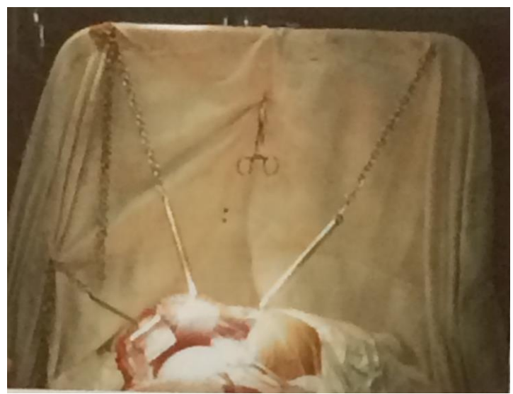
A DIY self-retractor used in one of the HPB units in Colombo

A liver transplant program was set up in 2011 with only small numbers being carried out. Both deceased and living donors are available in Sri Lanka but they are still some way to developing the full infrastructure and knowledge required both by the public and other health professionals. Many of the issues are centred on the reluctance of neurosurgeons and anaesthetist to collaborate. ITU beds are in short supply and organ donation slows the movement of patient through this department.