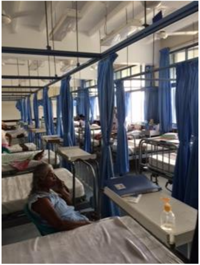
Female ward in Colombo South Hospital

The Surgeons outlined their future needs as: "Expert advice for complex cases, collaborative research and a common database of cases".