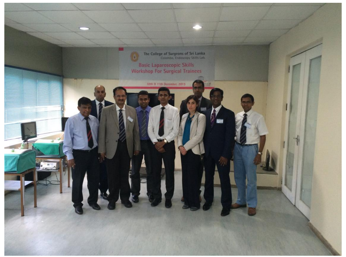
Faculty visit to the Laparoscopic Skills Laboratory in the RCS Sri Lanka

Later that day a 3-day joint clinical session of IHPBA and Sri Lankan Hepatobpancreaticobiliary Association (SLHPBA) began. This was attended by surgical trainees from across Colombo and consultant Surgeons with a specialist interest in HPB.